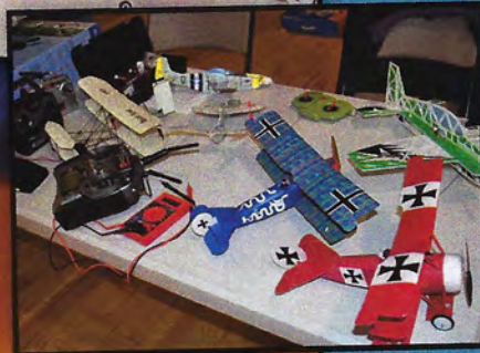
Variety was the order of the day on this pilot's work station, with a broad range of models from an easy-handling Wright Flyer to the fully aerobatic ParkZone UMX Extra.